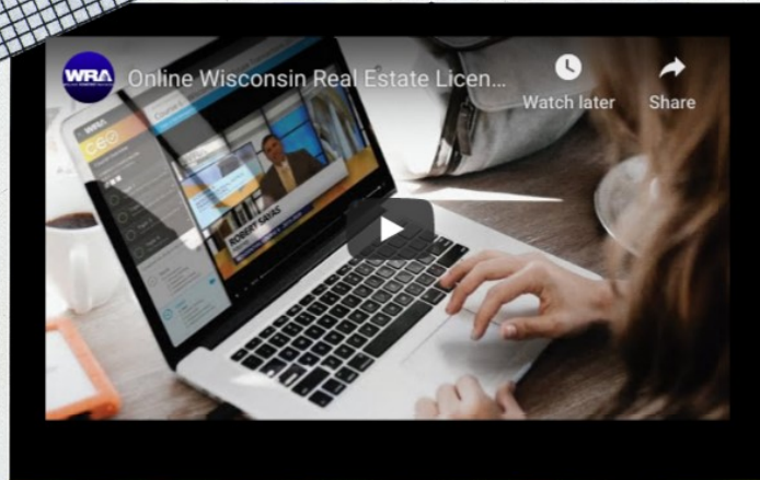
Online Wisconsin Real Estate License Renewal Step-by-Step Guide