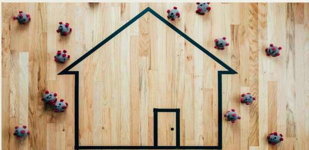
COVID-19 and the CODE

3rd - Foundation Directors Meeting 7th - Office Closed for Labor Day 15th-16th - WRA Convention, Kalahari Resort, Wisconsin Dells TBD - Awards and Installation Banquet