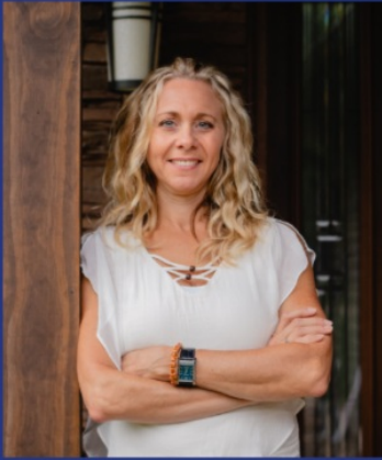
Coldwell Banker Brenizer Years in real estate: 6 years