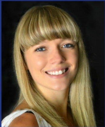
Coldwell Banker Brenizer, Rice Lake Years in real estate: 4 years