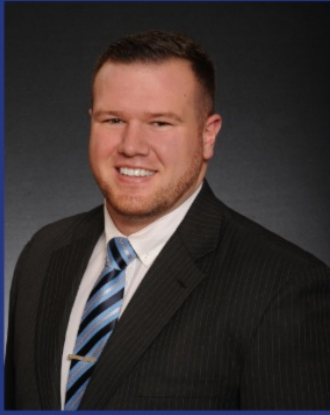
Keller Williams Realty Diversified Years in real estate: 5 years