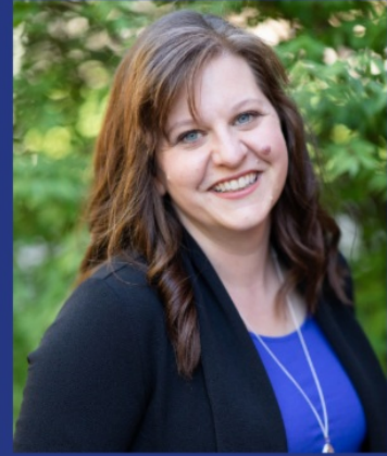
Keller Williams Realty Diversified Years in real estate: 4 years