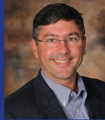
RE/MAX Affiliates Years in real estate: 23 years