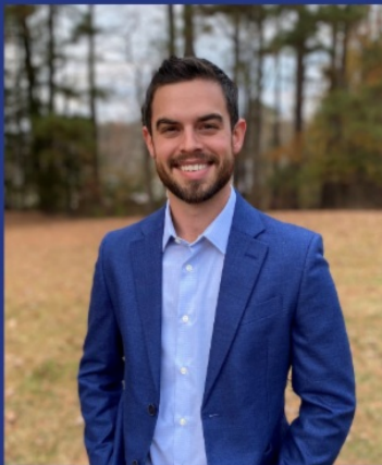
Woods and Water Realty Years in real estate: 3.75 years