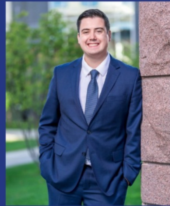
Keller Williams Realty Diversified Years in real estate: 4 years