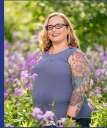
Coldwell Banker Brenizer Years in real estate: 7 years