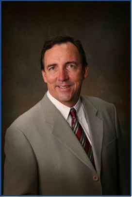
Dan Lawler Real Estate Solutions